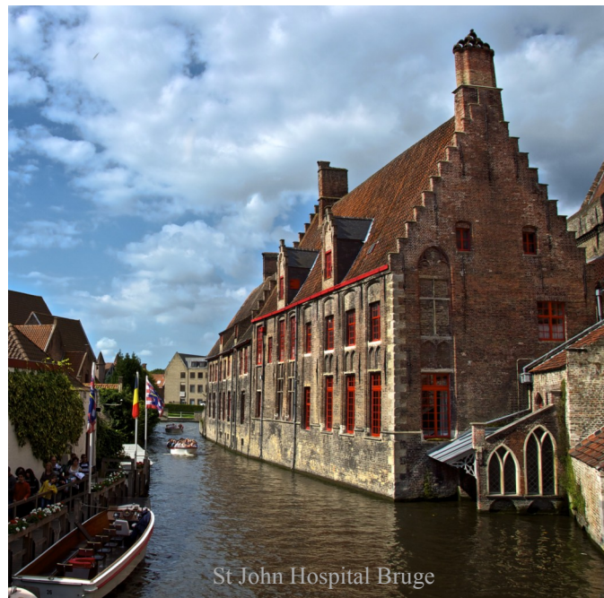
St John Hospital Bruges